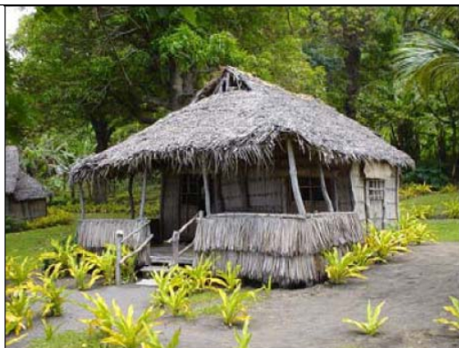
Figure 2a Friendly Bungalows, White Sands.

Tanna Island is one of Vanuatu's principle tourism destinations, hosting a small tourism industry composed of nine operational resorts, a further two under construction and one temporarily closed following landslide damage. Capacity varies from resorts capable of accommodating ten guests to larger resorts able to host up to 25 guests. In total, Tanna has approximately 100 tourist beds. Resorts are predominantly constructed in traditional Tannese style using local natural materials (Figure 2a). Some resorts are of semi-traditional construction style, combining the traditional bamboo and palm leaf style with concrete flooring. Two resorts on the island are constructed using modern or western materials such as concrete and corrugated steel (see Figure 2b). Tourism is based around the attraction of Mt. Yasur, one of the world's most easily accessible active volcanoes and the most frequently visited in Vanuatu (Vanuatu Tourism Office, undated; Wallez, 2001). Tourists are able to access the summit of the volcano and stand on the crater's rim to observe the eruptions. Additional attractions to the island include villages that have rejected a modern lifestyle and live in the traditional 'Kastom' style, and the John Frum religious cult (O'Bryne and Harcombe, 1999).