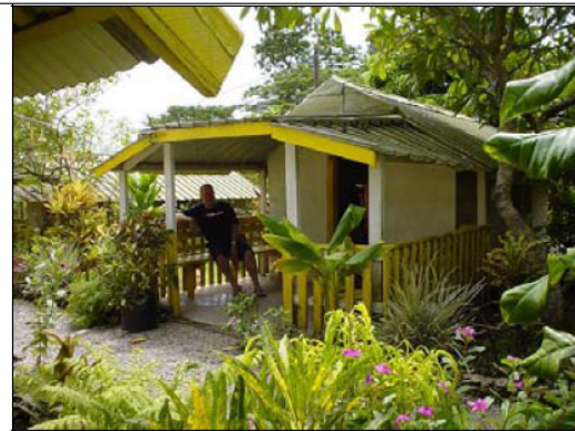
Figure 2b Uma Guesthouse, Lenakel.

This study looks at the tourism industry in Tanna, in particular the accuracy of the perception of natural hazards held by individuals involved in the tourism industry.